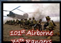
101 st Airborne 75 th Rangers "Task Force Mountain"